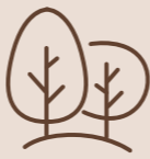
Easy Access to the West Park