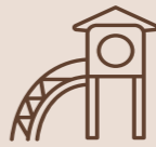
Kid's Play Areas