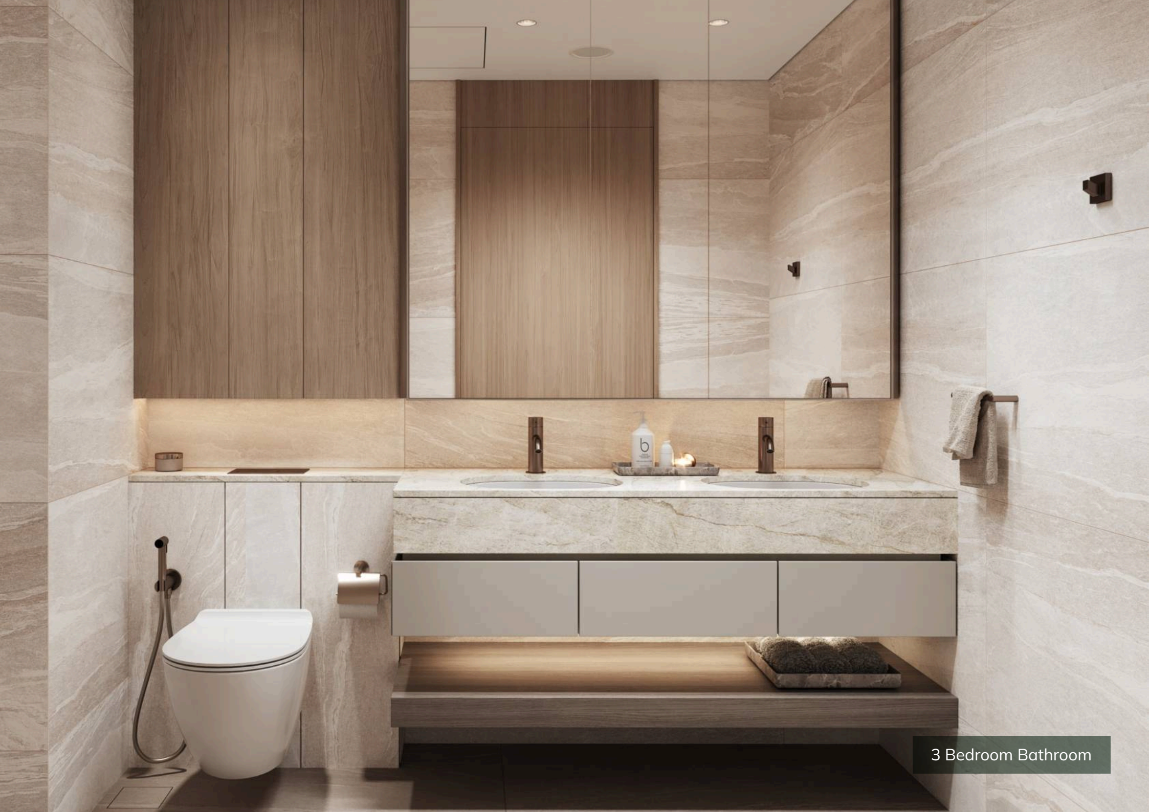
3 Bedroom Bathroom