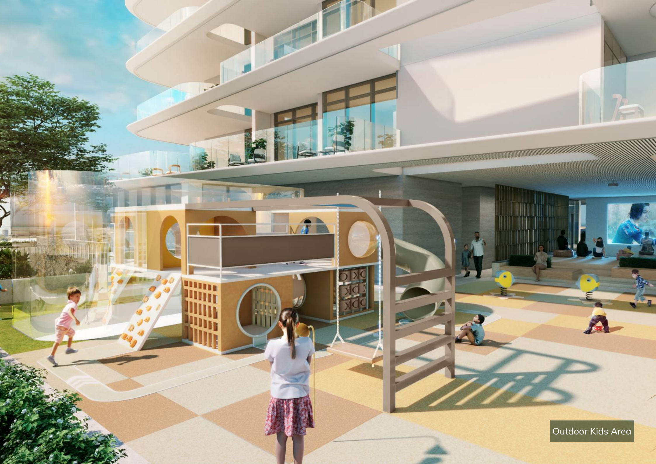
Outdoor Kids Area