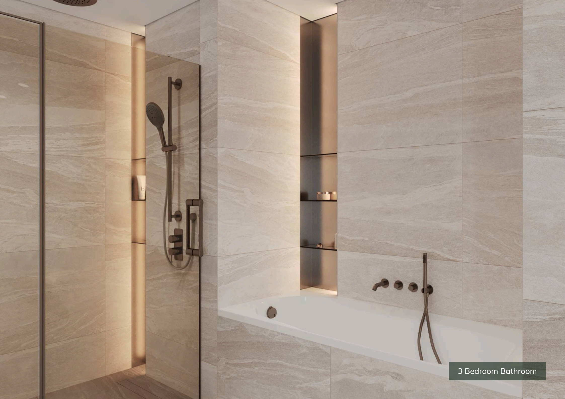
3 Bedroom Bathroom