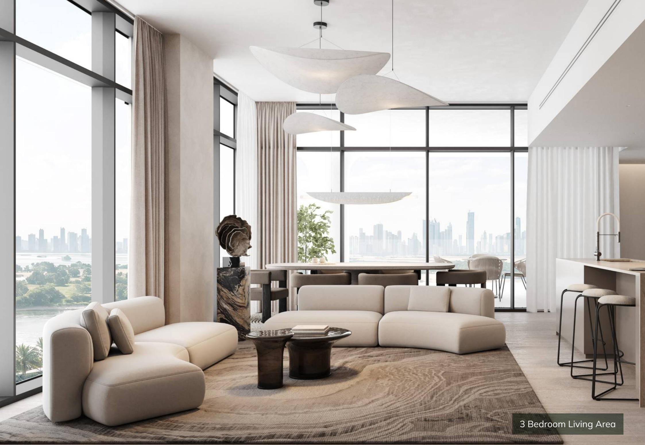
3 Bedroom Living Area