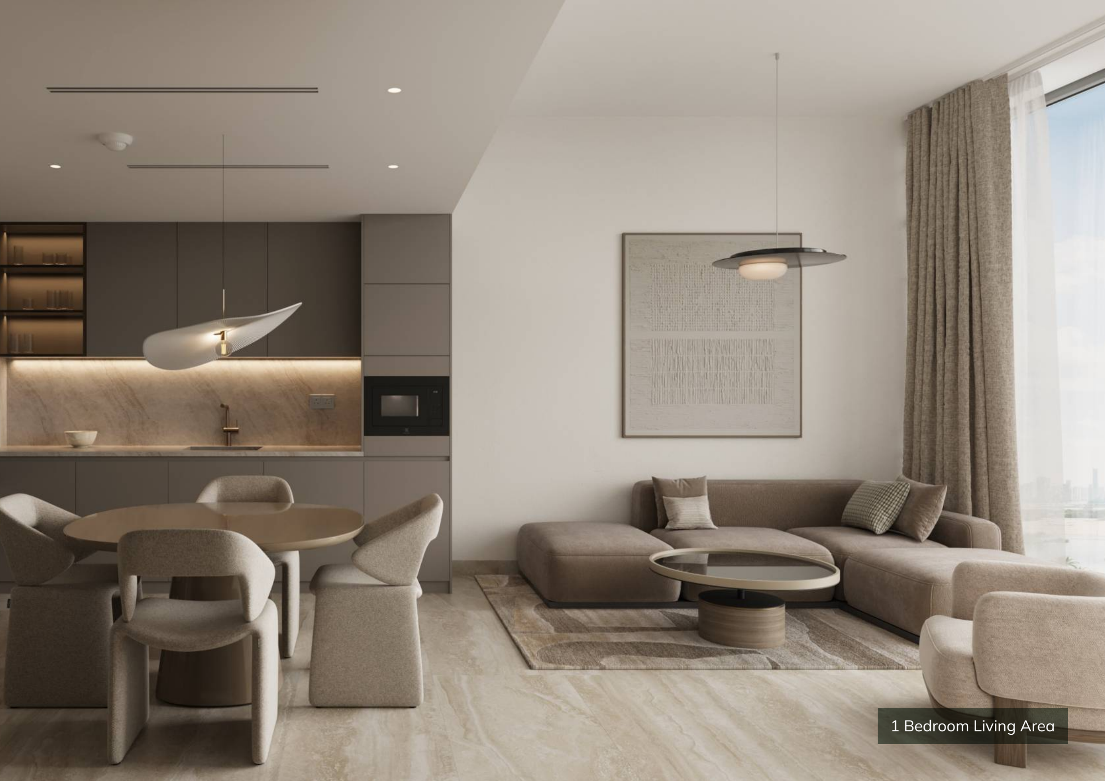
1 Bedroom Living Area