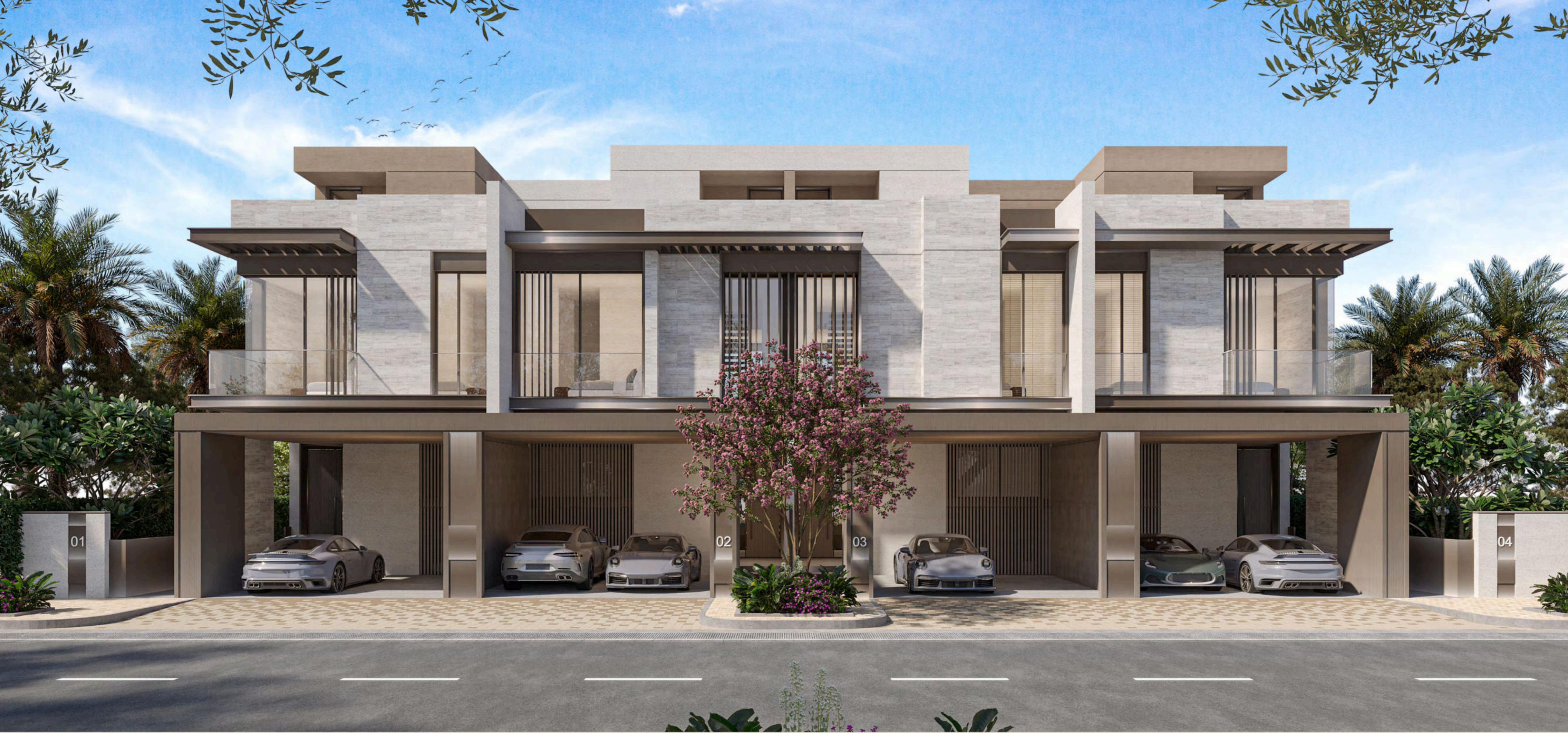
3-BEDROOM TOWNHOUSE | 4PLEX