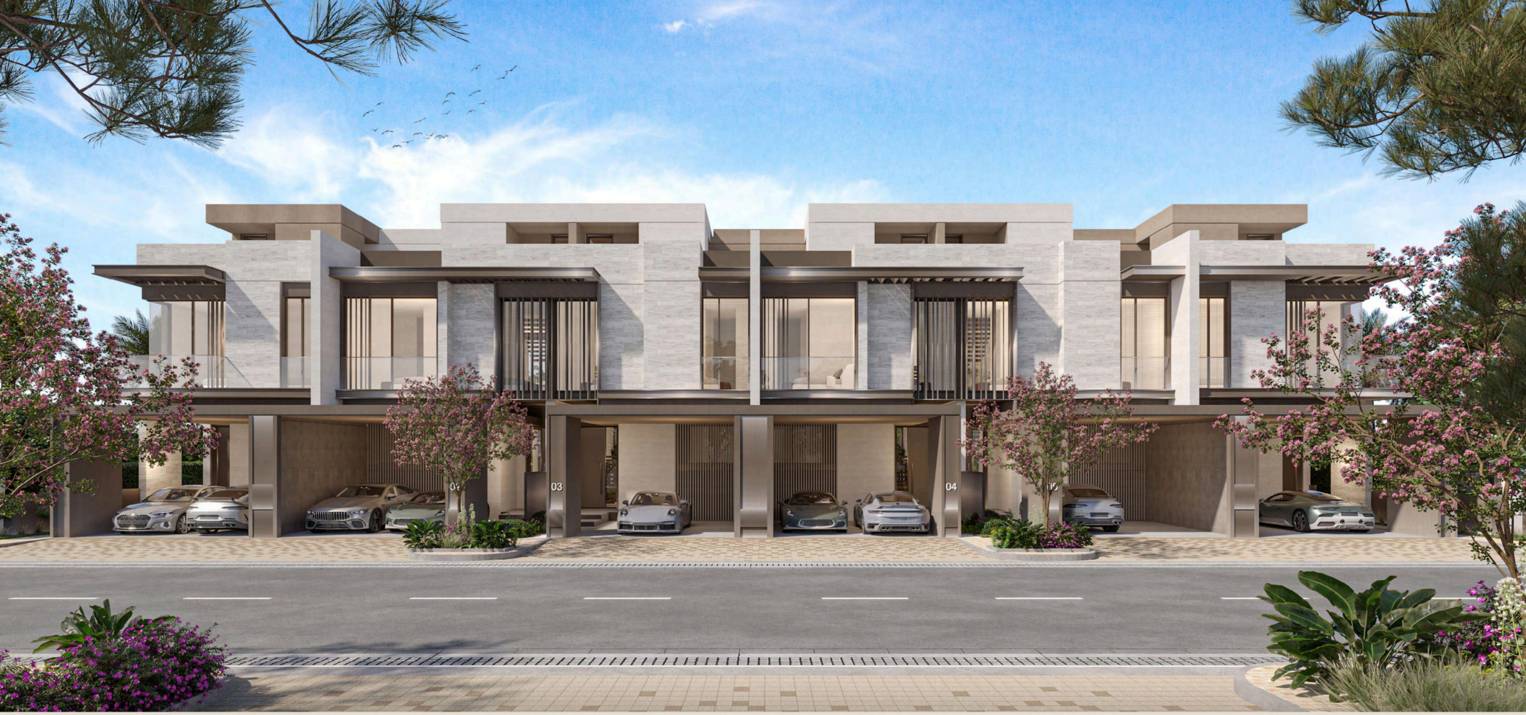
3-BEDROOM TOWNHOUSE | 6PLEX