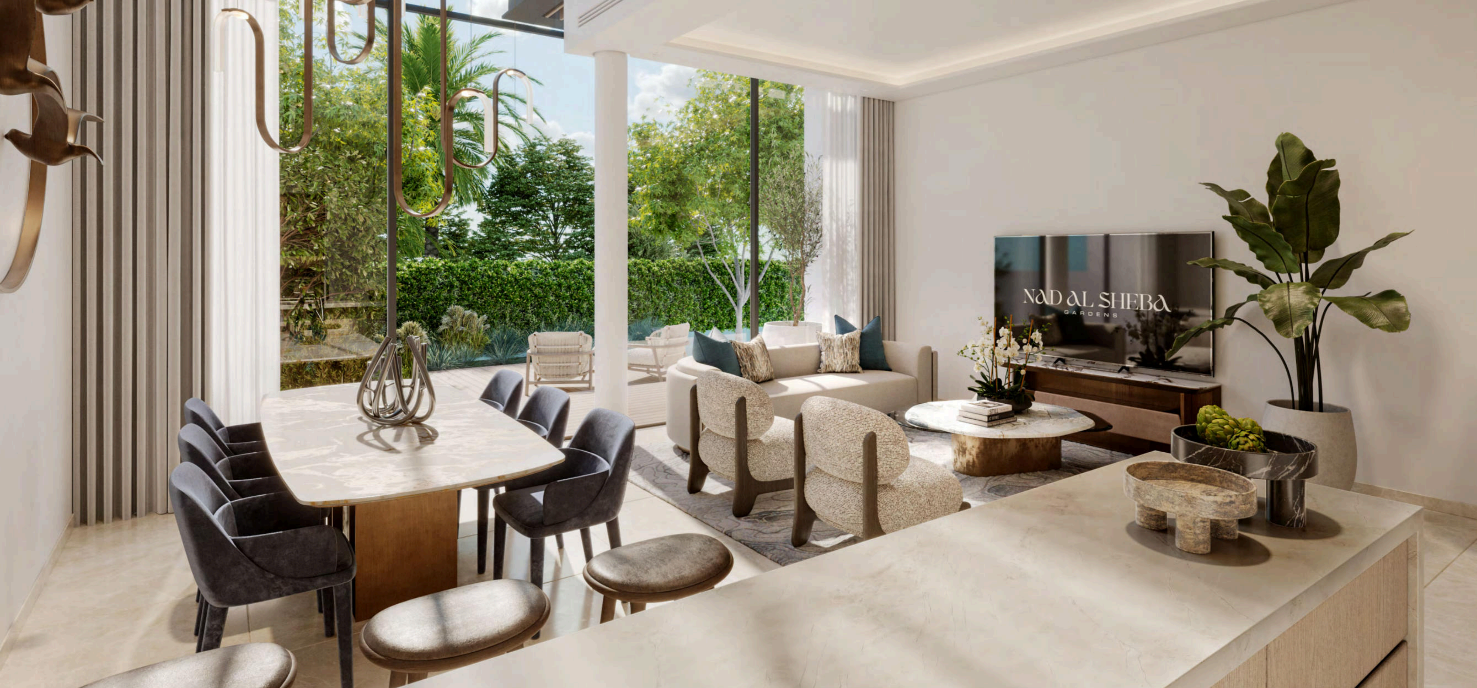
3-BEDROOM TOWNHOUSE | LIVING & DINING