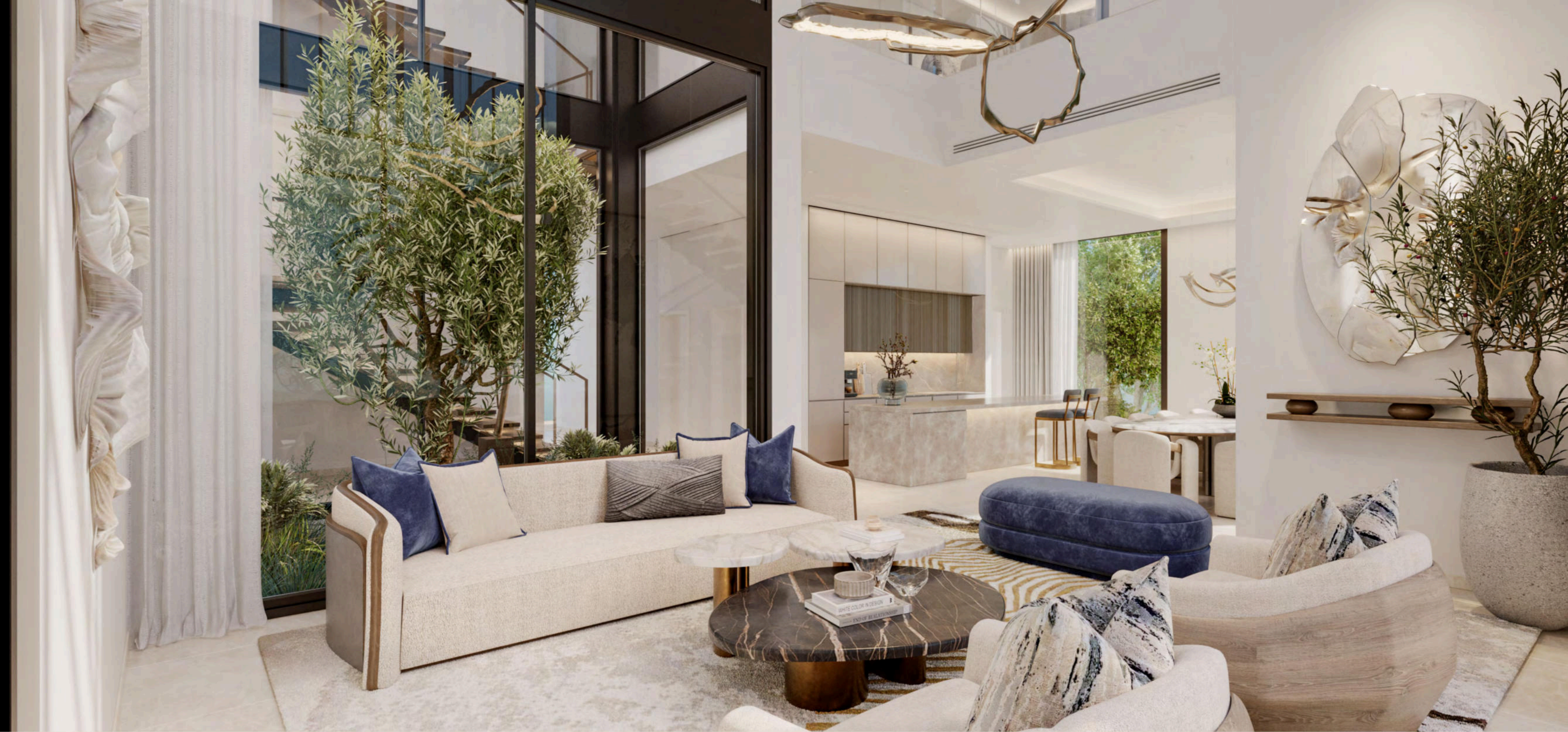
4-BEDROOM VILLA | LIVING ROOM