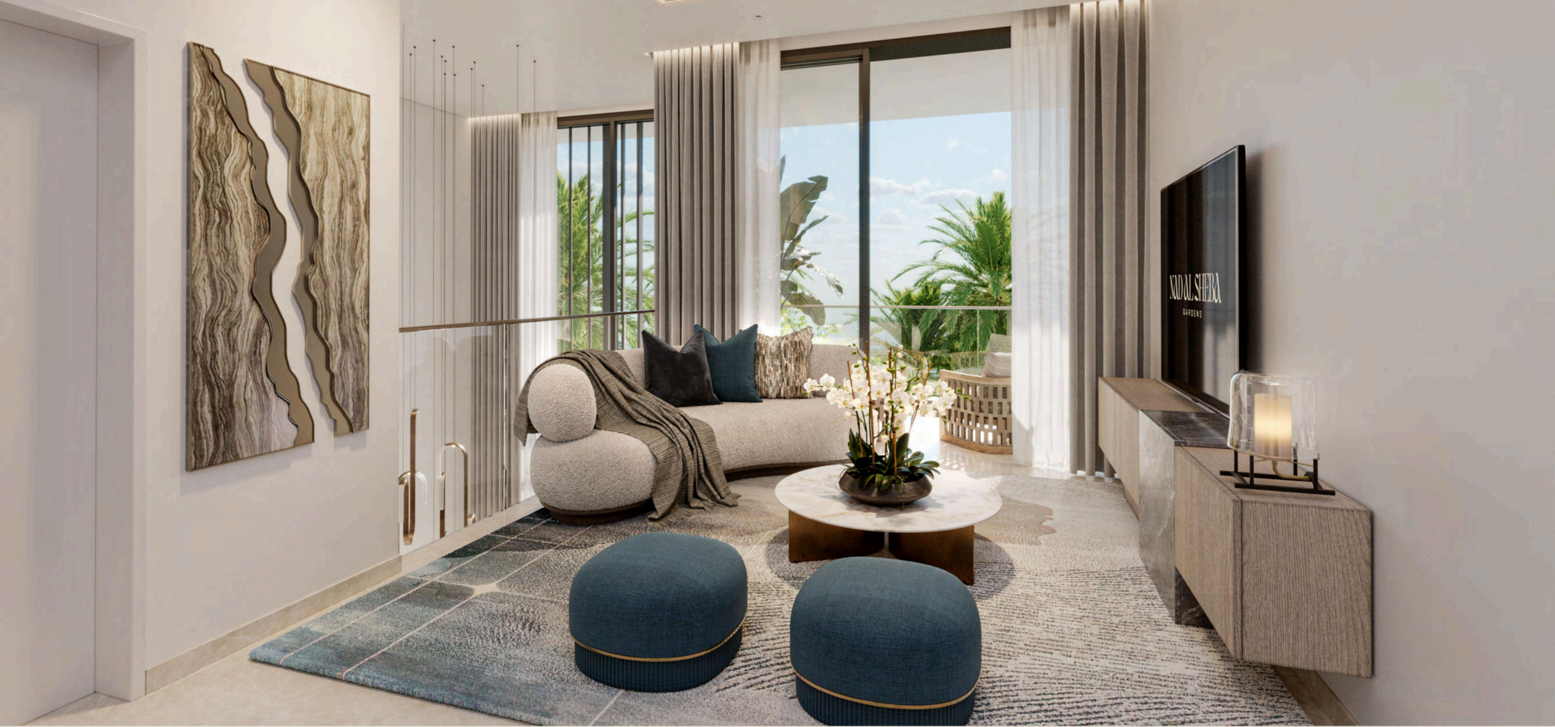
3-BEDROOM TOWNHOUSE | FAMILY ROOM