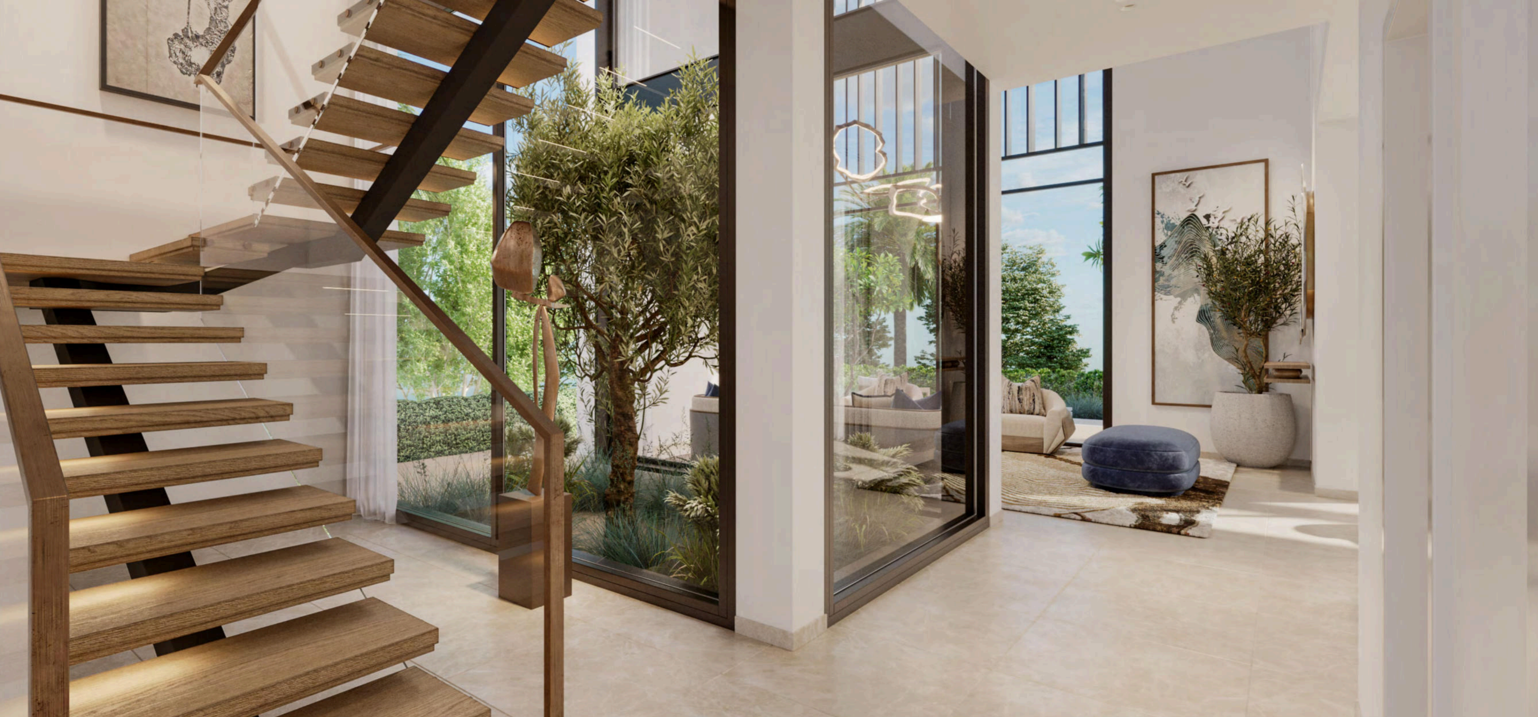
4-BEDROOM VILLA | STAIRCASE