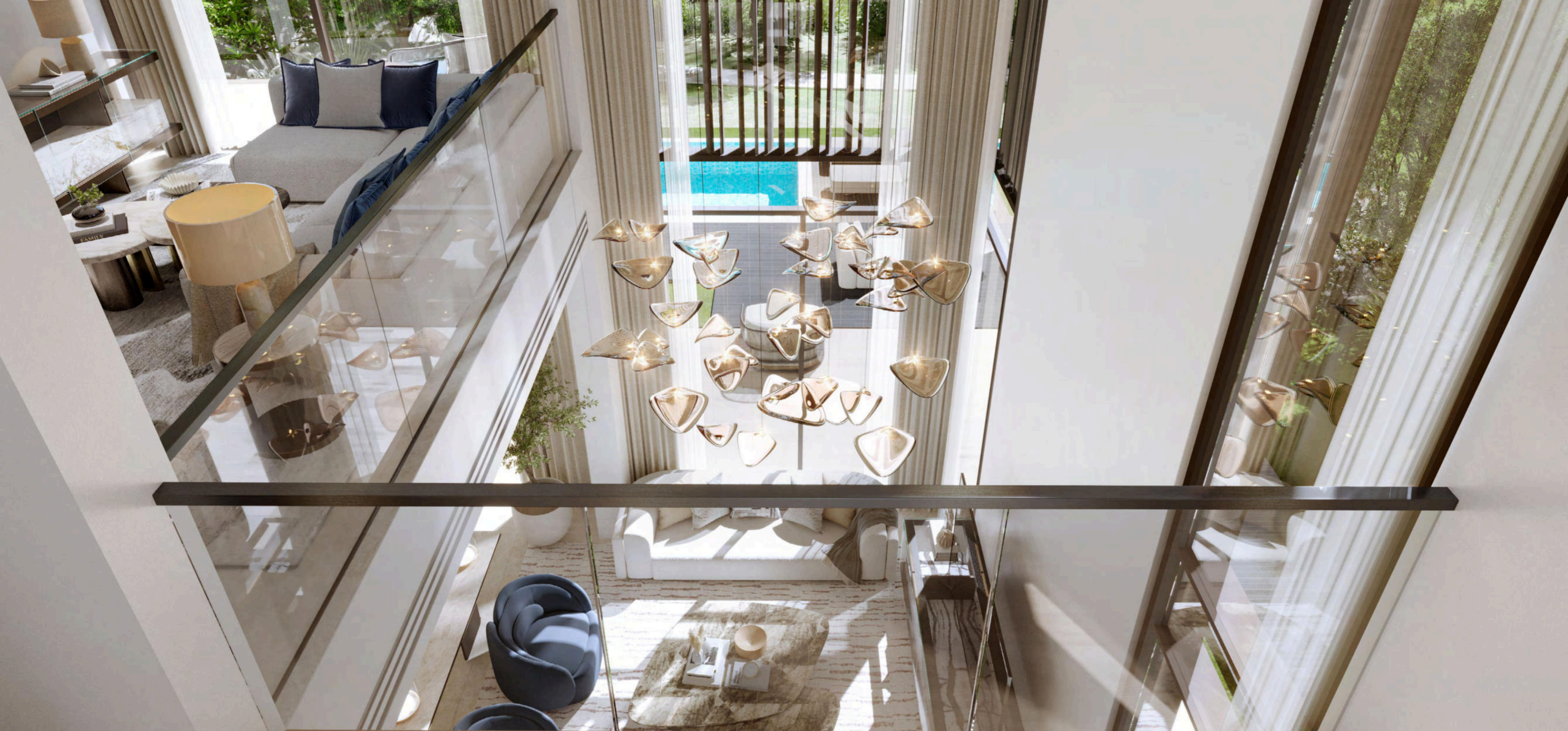
5-BEDROOM VILLA | LIVING ROOM