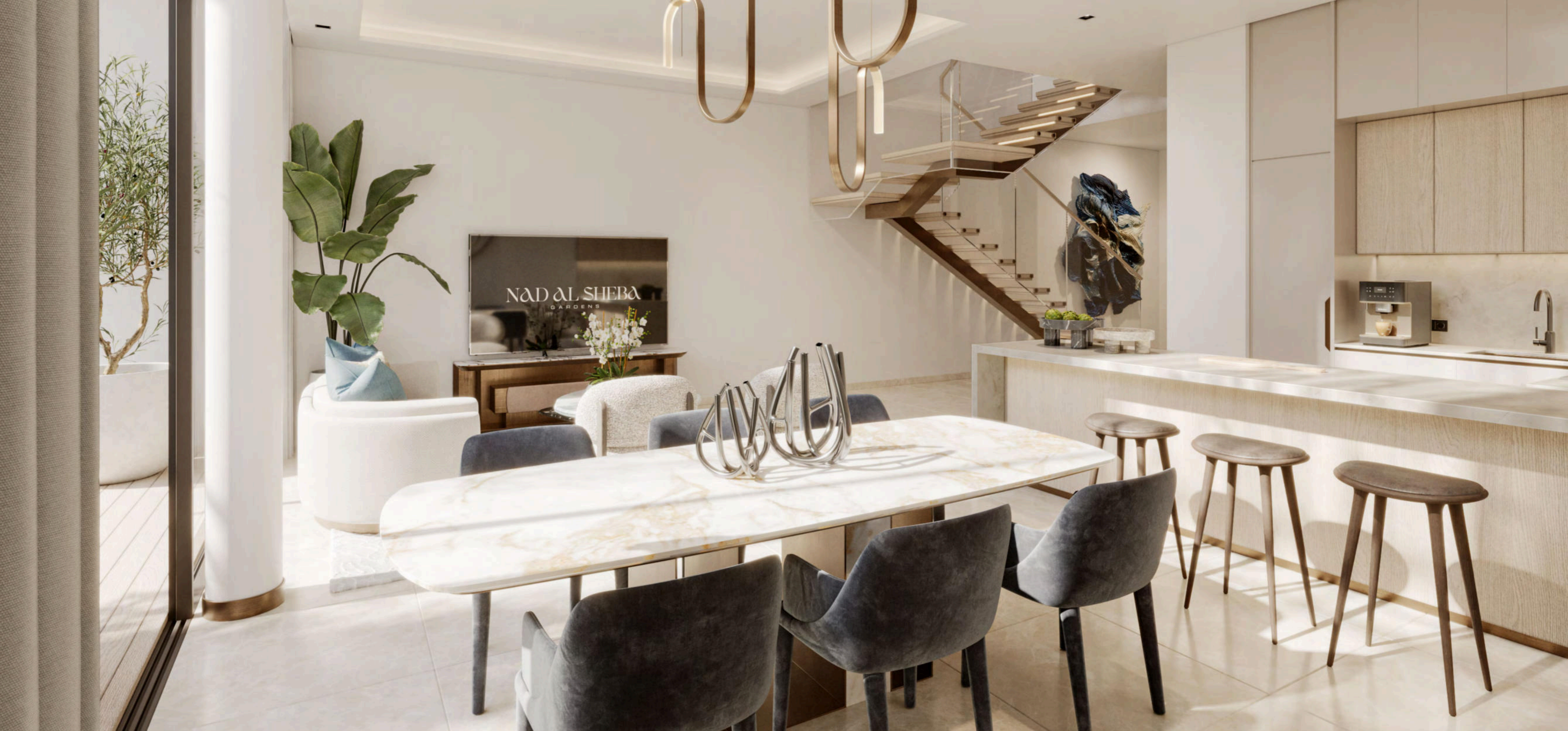
3-BEDROOM TOWNHOUSE | LIVING & DINING