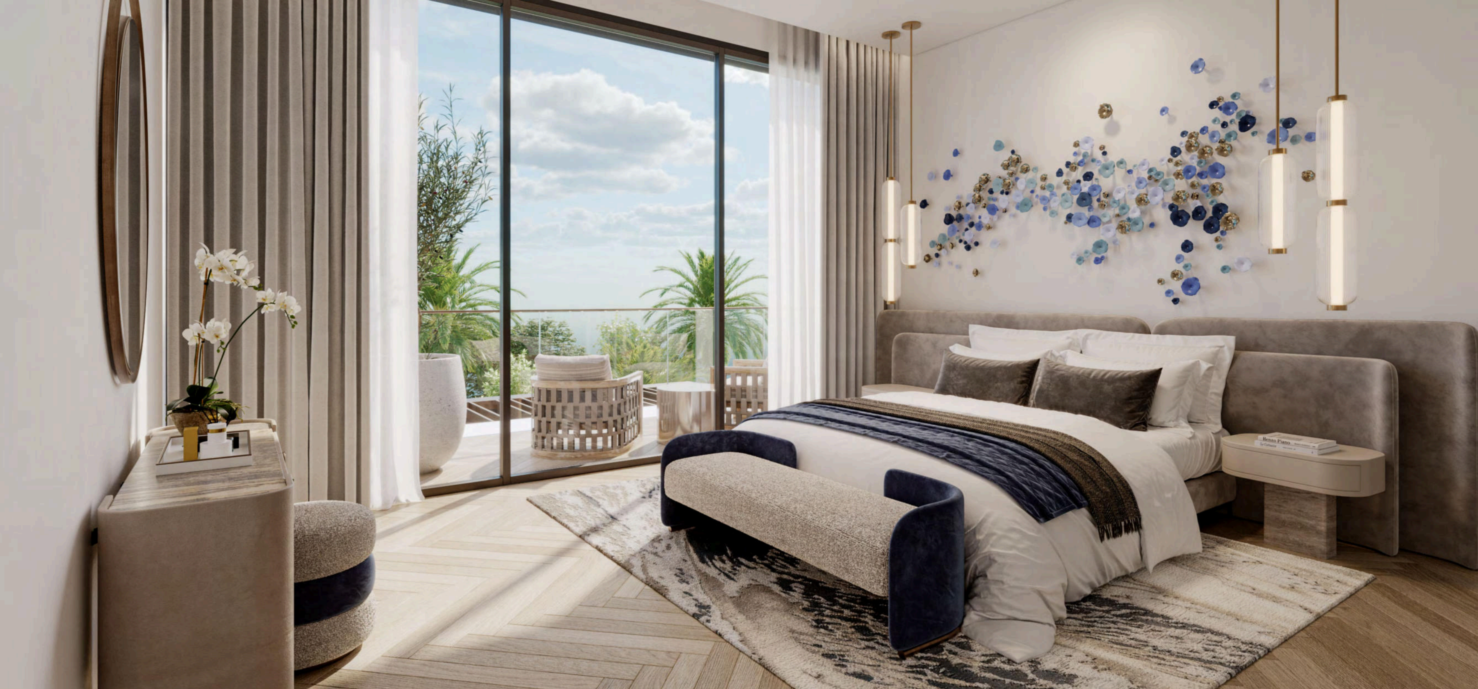
4-BEDROOM VILLA | BEDROOM