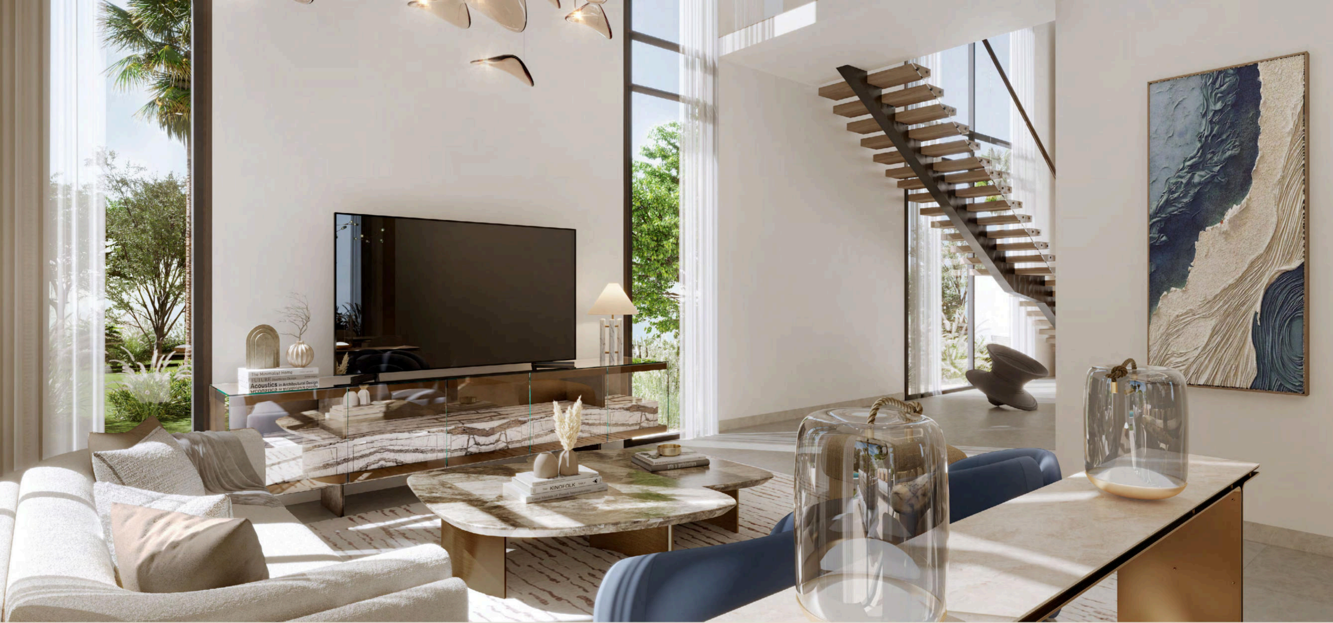
5-BEDROOM VILLA | LIVING ROOM