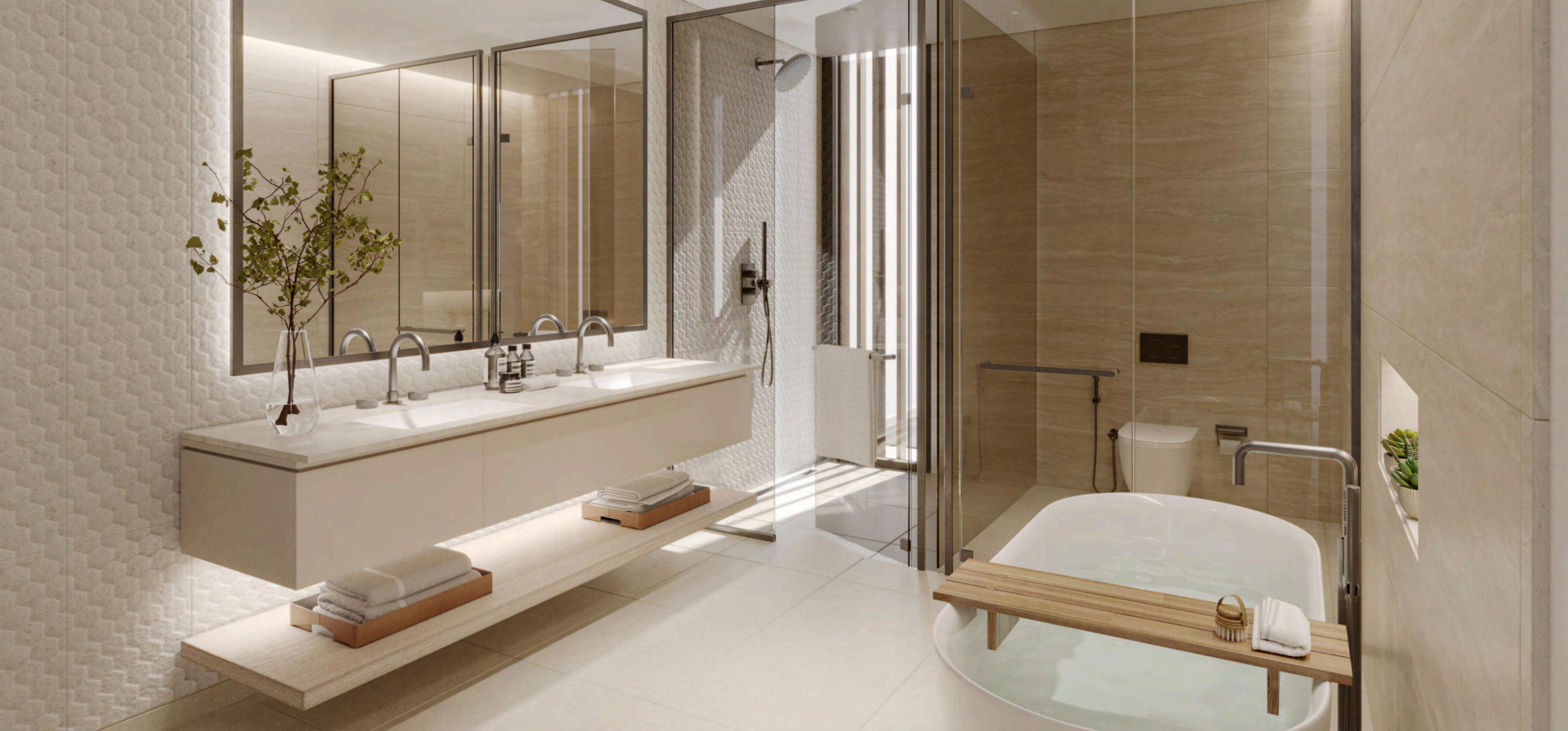
3-BEDROOM TOWNHOUSE | BATHROOM