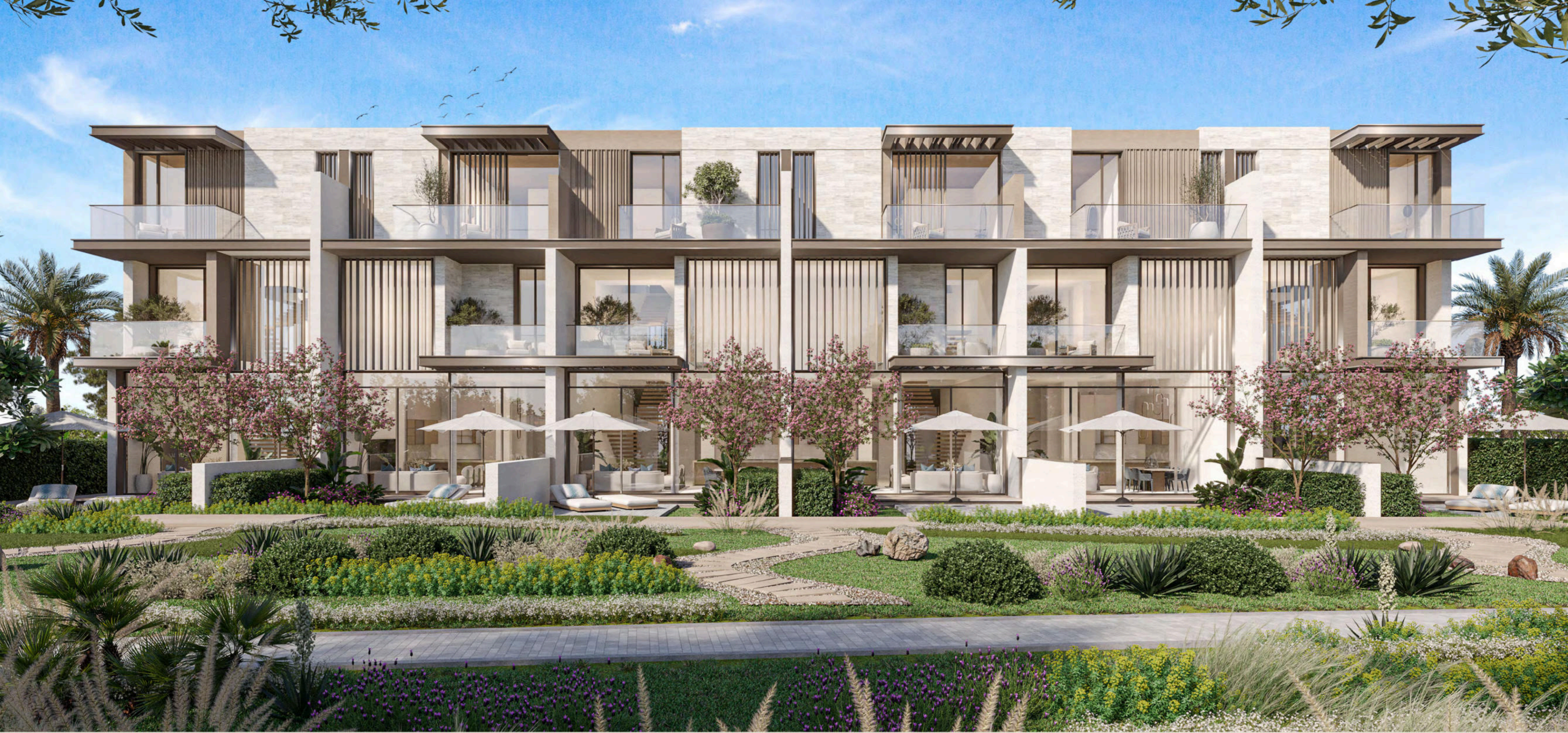
3-BEDROOM TOWNHOUSE | 6PLEX