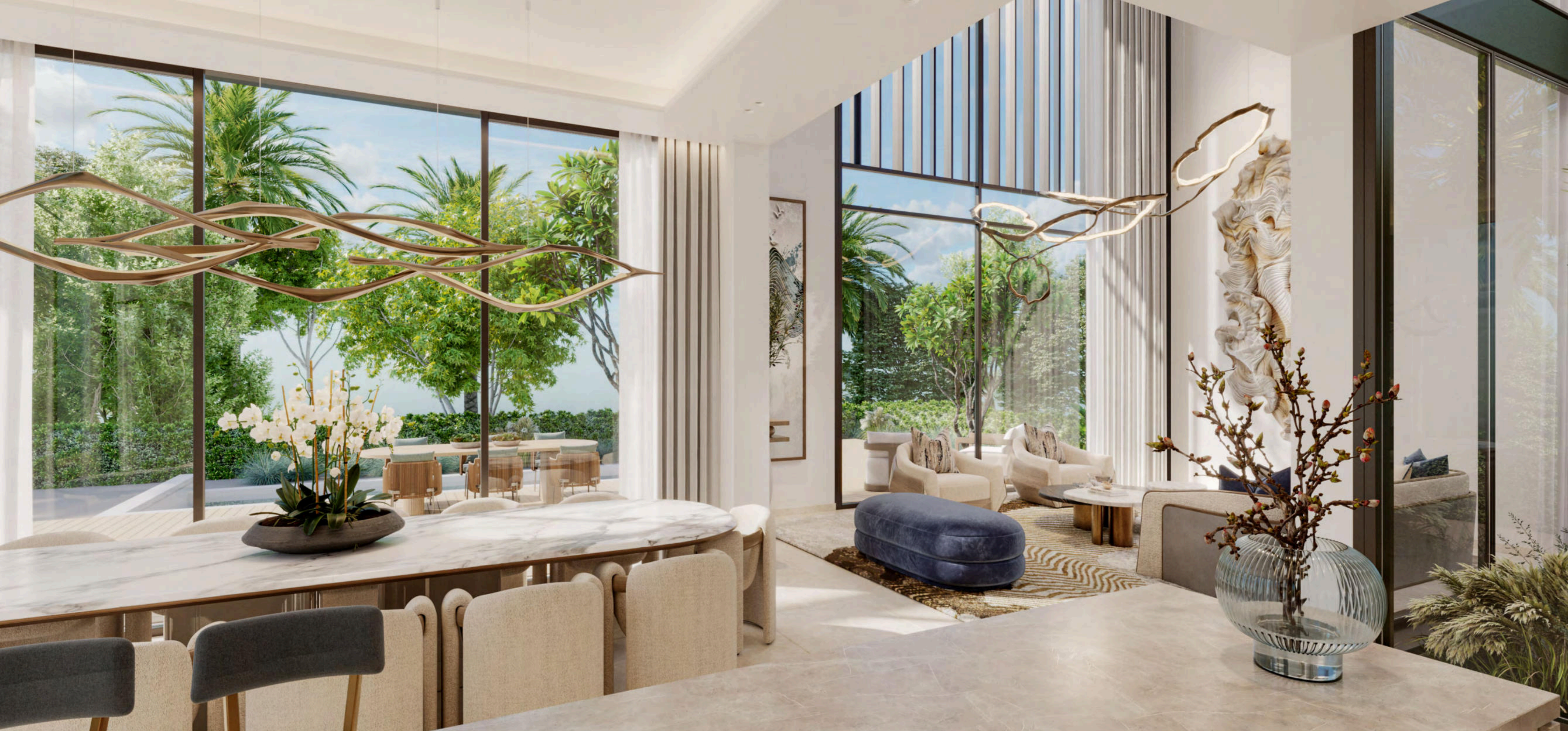
4-BEDROOM VILLA | LIVING & DINING