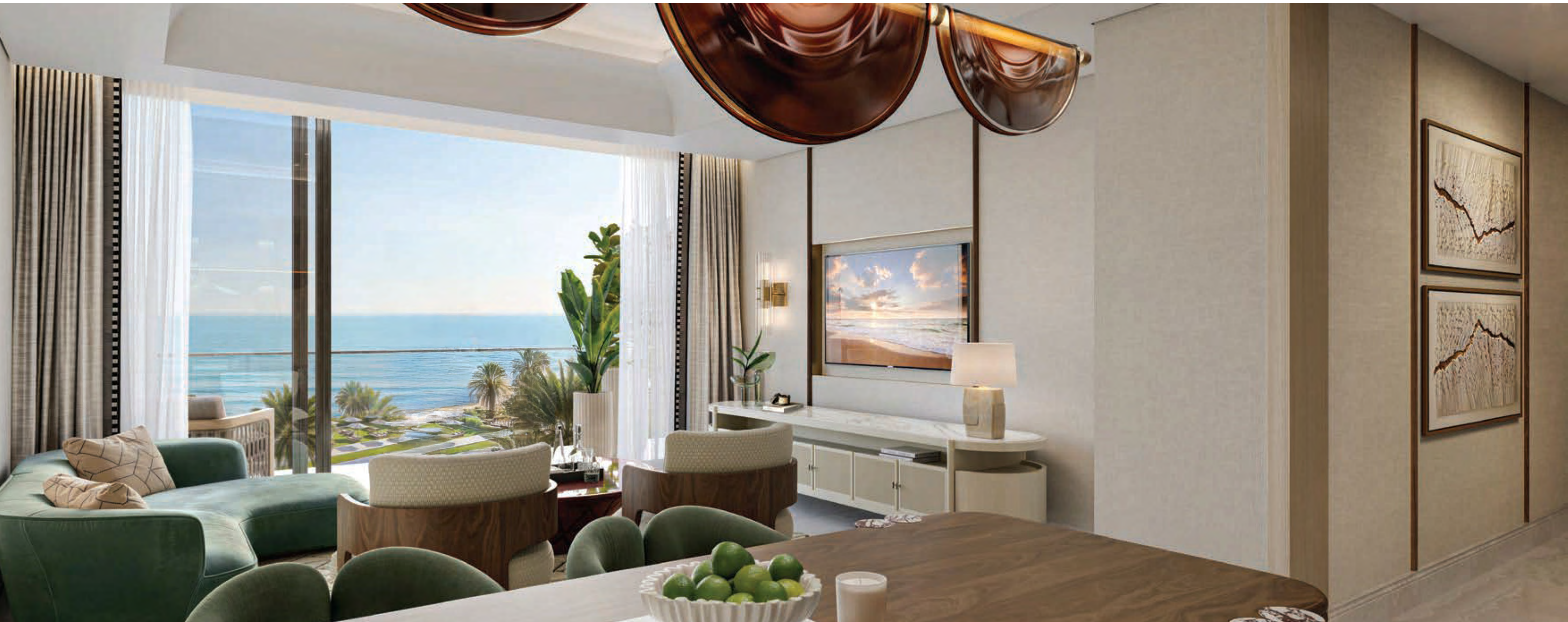
Two Bedroom Residences

Our expansive two-bedroom residences are a masterpiece of balance. Inside, everything speaks of refinement, from the tactile richness of materials to the modern design.