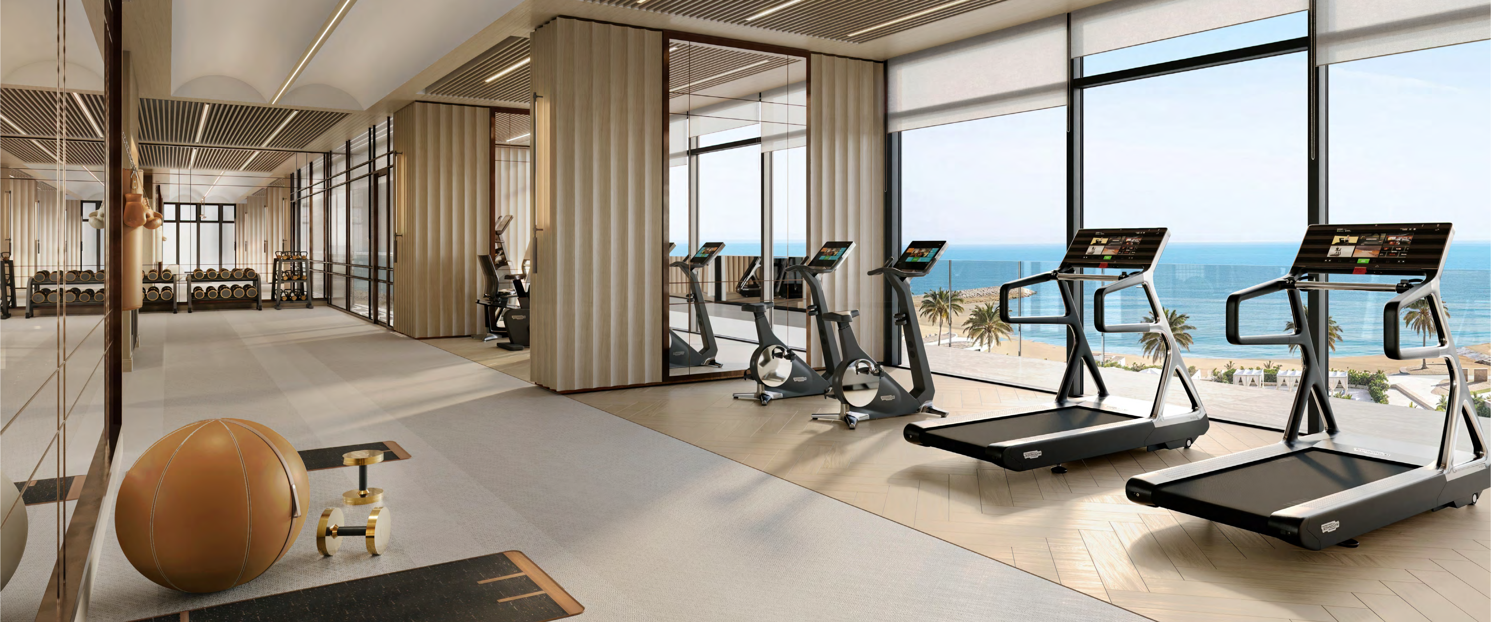
Fairmont Fit Fitness Studio