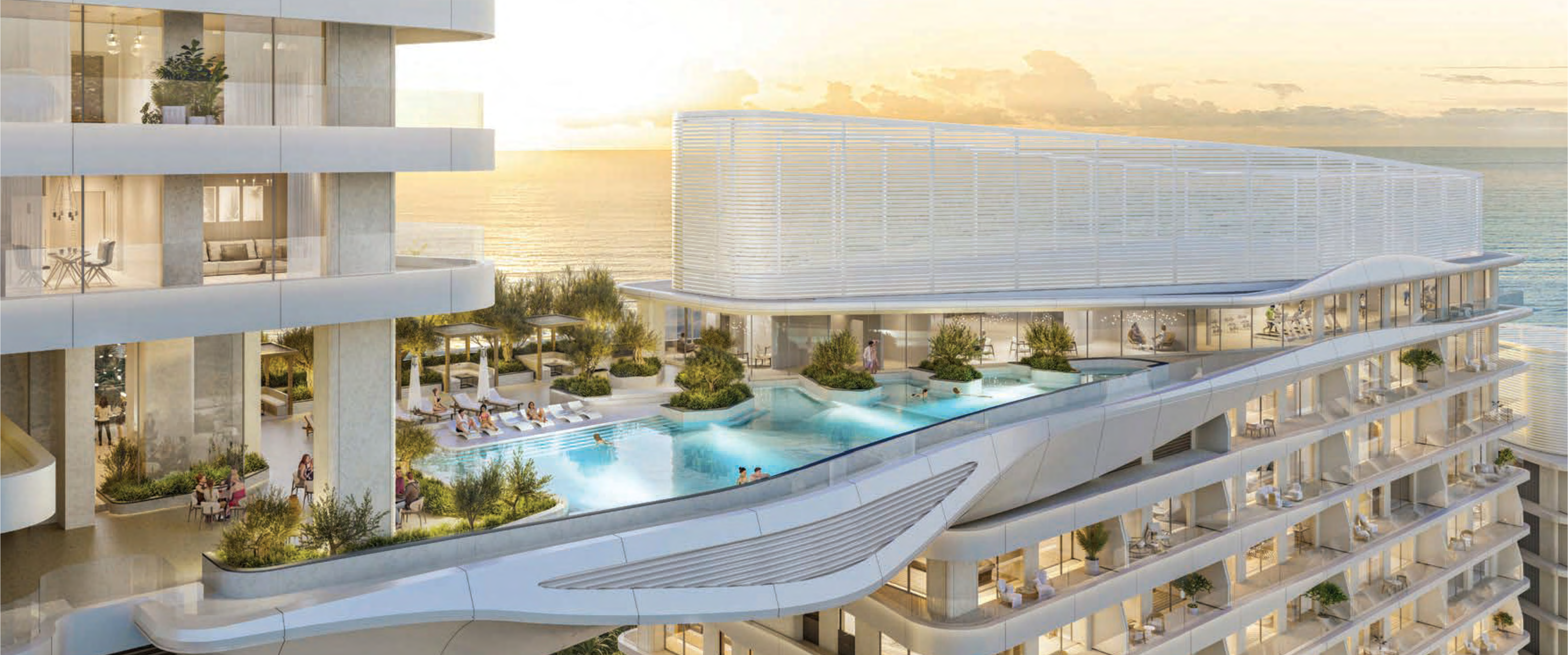
Adult Sky Pool