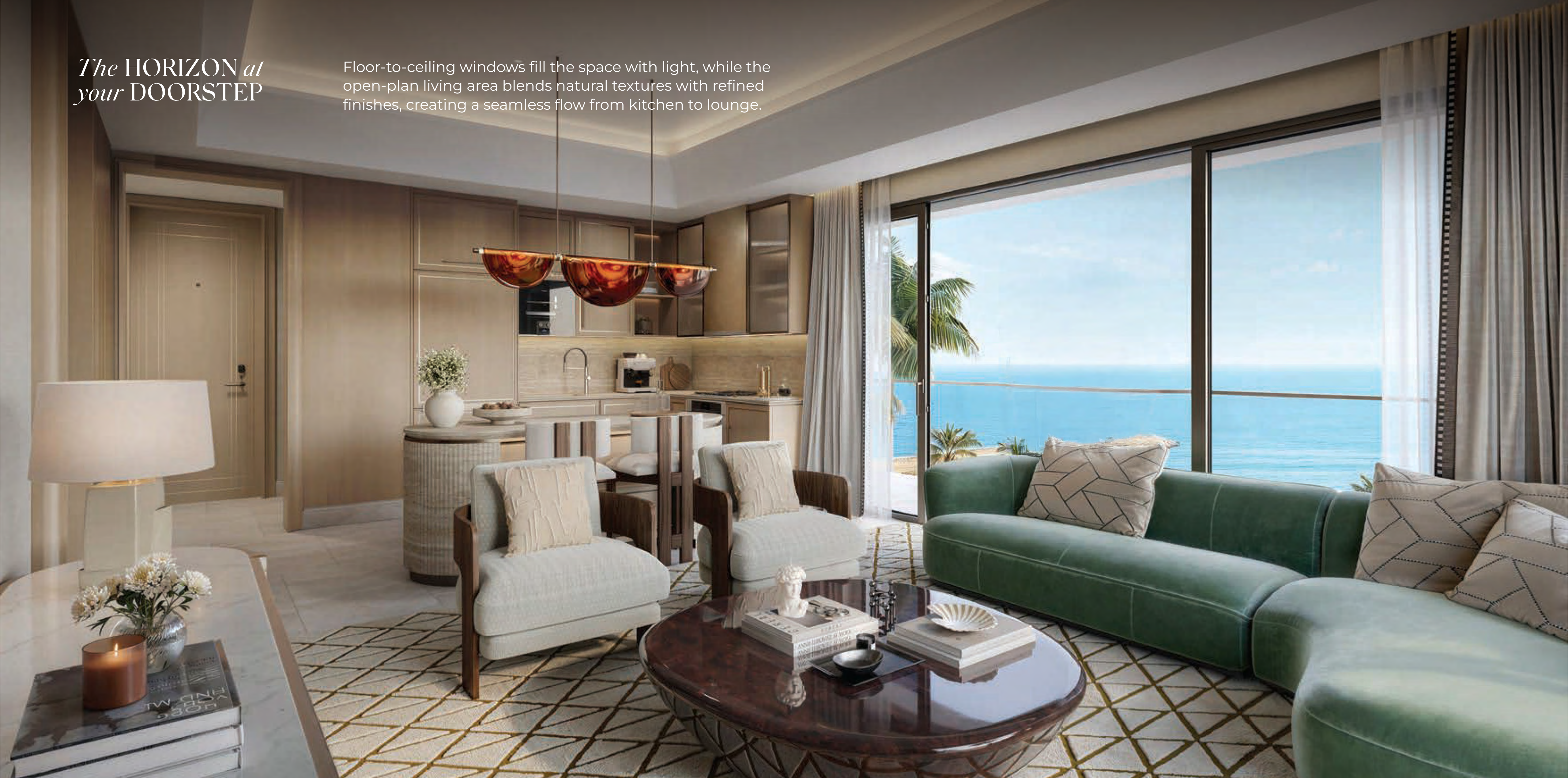
One Bedroom Residences

Floor-to-ceiling windows fill the space with light, while the open-plan living area blends natural textures with refined finishes, creating a seamless flow from kitchen to lounge.